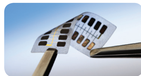
Xerox® Printed Memory

Built-in, real-time eTRACS analytics spotlight counterfeiting and gray market activity from production line to point of sale to protect revenue and brand reputation. Dashboard reporting and a business portal provide easy access for brand managers, supply chain partners, practitioners and consumers with instant product verification. The combination of eTRACS and the Xerox® BrandSecure Packaging Solution gives brand owners an invaluable tool in the fight to protect consumers and preserve brand equity.