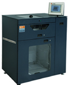
C.P. Bourg® Dual-Mode Sheet Feeder (BSF)