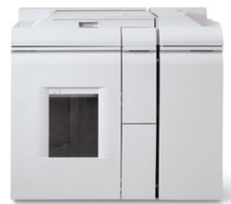
Basic Finisher Module – Direct Connect (BFM-DC)