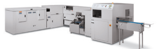
Xerox® Book Factory