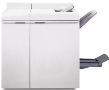
Multifunction Finisher Professional