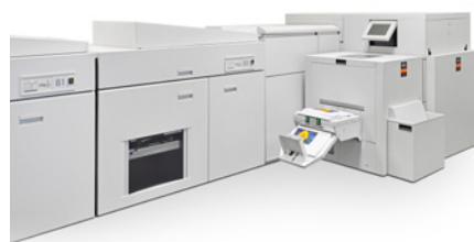
Watkiss PowerSquare™ 224