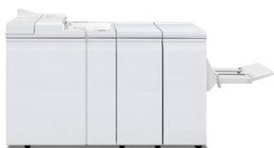
Plockmatic Pro 50/35 Booklet Maker

*Available on Xerox Nuvera® 100/120/144/157 EA Production Systems