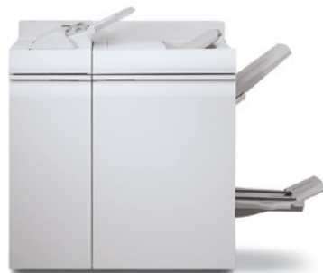
Multifunction Finisher Pro Plus