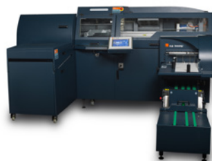
C.P. Bourg® 3202 Perfect Binder