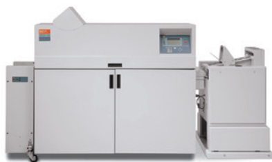
C.P. Bourg® BDFNx Booklet Maker with Square Edge