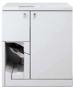
Xerox® Tape Binder