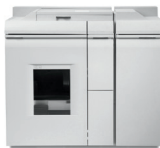
Basic Finisher Module – Bypass