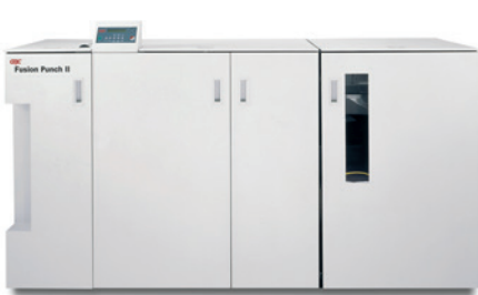
GBC® FusionPunch® II