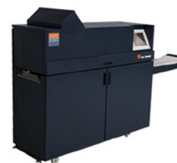
C.P. Bourg® BDF-e

For full bleed (three-sided trimming), the Bleed Crease Module (BCM-e) is offered as an optional device.