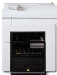
Xerox® Production Stacker