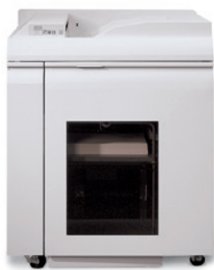
Xerox® DS3500 Stacker