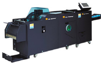
C.P. Bourg® BM-e Booklet Maker

Adding a perfect finishing device to your Xerox Nuvera® 200/288/314 Perfecting Production System and Xerox Nuvera® 100/120/144/157 Production System has never been easier. You'll appreciate the variety of outstanding inline finishing solutions that are available from Xerox to help you quickly and efficiently produce high-quality bound documents. We offer you the widest range of finishing options you need to wrap up your jobs professionally.