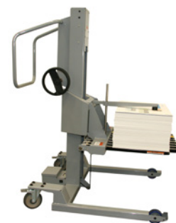
Production Media Cart