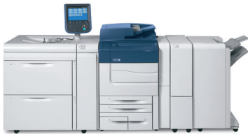
Xerox® Colour C60/C70 Printer

Posters can open more doors with the help of digitally optimised, coated media combined with the Xerox® Colour C60/C70 Printer and Xerox® D Series Copier/Printer or Printer.