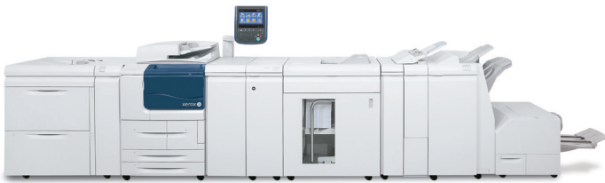
Xerox® D Series Copier/Printer